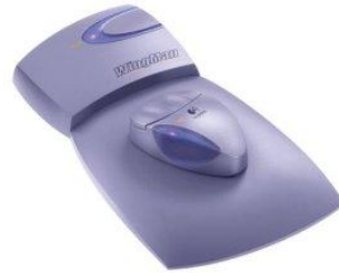
Fig. 2. Logitech Wingman force-feedback mouse [14]

Blind users have the choice of using the keyboard, or using both the keyboard and the Logitech Wingman force-feedback mouse (Figure 2) to interact with the game. The interface contains four different-colored buttons (labeled ‘red,’ ‘blue,’ ‘green’ or ‘orange’) arranged in the shape of a cross. Each button is mapped to an earcon or speech icon, which is presented for a period of 100ms at 60dB using recommendations from [5] (Table 1). The buttons were recreated in the auditory domain using non-speech sound by manipulating the pitch and spatial position of a pure sine tone. Upward movements are indicated by a 1 second sine tone with an upward frequency glissando (220Hz-880Hz) and a sine tone with a downward glissando indicates a downward movement (880Hz-220Hz). Left and right positions were implemented by adjusting the spatial position of a 1 second sine tone (440Hz) earcon accordingly. Haptic spring effects were developed and integrated with the interface to provide guidance towards a target (button labeled ‘red,’ ‘blue,’ ‘green’ or ‘orange’). For example, to prompt the user to move rightwards, the mouse gently guides the users’ hand towards the right-hand side of the page.