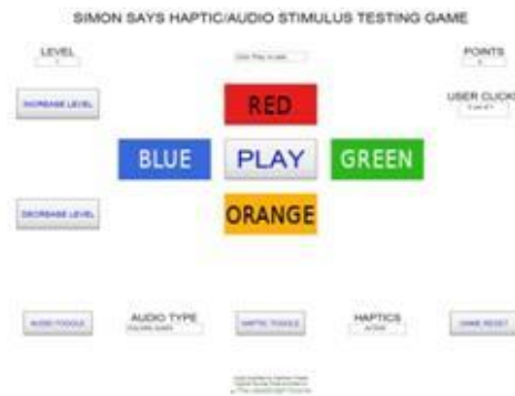
Fig. 1. Accessible multimodal memory game

‘Simon™’ [7] is an electronic game, where the user is presented with a sequence of flashing colored lights and tones from an electronic device. The user is required to replicate the sequence, by pressing the colored buttons on the device in exactly the same order as originally presented. A multimodal game has been developed based on Simon™ (Figure 1). This was designed with the aim of being accessible to users who are blind. The user is presented with the following forms of feedback: speech, non-speech audio, haptics, and graphics. The user can use one or more forms of each type of feedback to play the game.