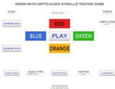
Fig. 1. Accessible multimodal memory game

‘Simon™’ [7] is an electronic game, where the user is presented with a sequence of flashing colored lights and tones from an electronic device. The user is required to replicate the sequence, by pressing the colored buttons on the device in exactly the same order as originally presented. A multimodal game has been developed based on Simon™ (Figure 1). This was designed with the aim of being accessible to users who are blind. The user is presented with the following forms of feedback: speech, non-speech audio, haptics, and graphics. The user can use one or more forms of each type of feedback to play the game.