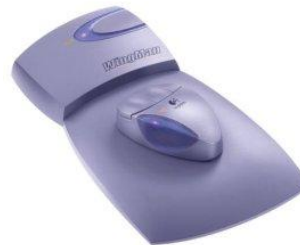
Fig. 2. Logitech Wingman force-feedback mouse [14]

Blind users have the choice of using the keyboard, or using both the keyboard and the Logitech Wingman force-feedback mouse (Figure 2) to interact with the game. The interface contains four different-colored buttons (labeled ‘red,’ ‘blue,’ ‘green’ or ‘orange’) arranged in the shape of a cross. Each button is mapped to an earcon or speech icon, which is presented for a period of 100ms at 60dB using recommendations from [5] (Table 1). The buttons were recreated in the auditory domain using non-speech sound by manipulating the pitch and spatial position of a pure sine tone. Upward movements are indicated by a 1 second sine tone with an upward frequency glissando (220Hz-880Hz) and a sine tone with a downward glissando indicates a downward movement (880Hz-220Hz). Left and right positions were implemented by adjusting the spatial position of a 1 second sine tone (440Hz) earcon accordingly. Haptic spring effects were developed and integrated with the interface to provide guidance towards a target (button labeled ‘red,’ ‘blue,’ ‘green’ or ‘orange’). For example, to prompt the user to move rightwards, the mouse gently guides the users’ hand towards the right-hand side of the page.