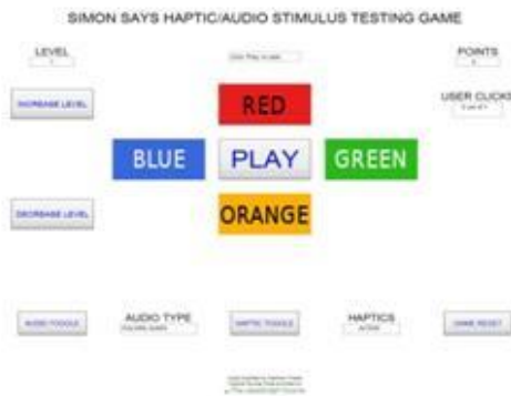
Fig. 1. Accessible multimodal memory game

‘Simon™’ [7] is an electronic game, where the user is presented with a sequence of flashing colored lights and tones from an electronic device. The user is required to replicate the sequence, by pressing the colored buttons on the device in exactly the same order as originally presented. A multimodal game has been developed based on Simon™ (Figure 1). This was designed with the aim of being accessible to users who are blind. The user is presented with the following forms of feedback: speech, non-speech audio, haptics, and graphics. The user can use one or more forms of each type of feedback to play the game.