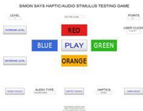
Fig. 1. Accessible multimodal memory game

‘Simon™’ [7] is an electronic game, where the user is presented with a sequence of flashing colored lights and tones from an electronic device. The user is required to replicate the sequence, by pressing the colored buttons on the device in exactly the same order as originally presented. A multimodal game has been developed based on Simon™ (Figure 1). This was designed with the aim of being accessible to users who are blind. The user is presented with the following forms of feedback: speech, non-speech audio, haptics, and graphics. The user can use one or more forms of each type of feedback to play the game.