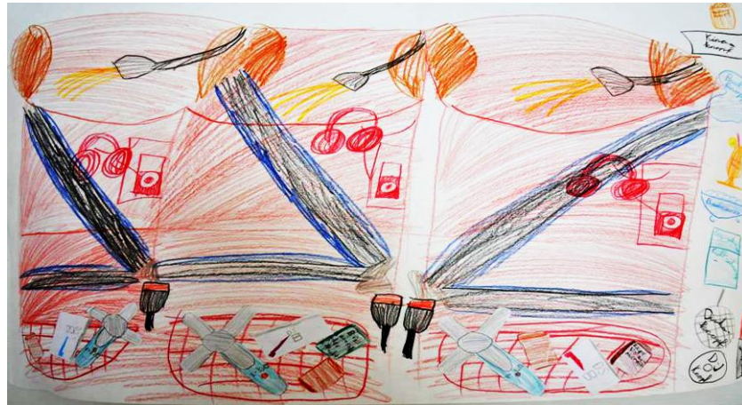
Fig.2. Proposed rear seat layout with three identical seats

together giving them the possibility to sing the songs as a family. “We dock our MP3 Player so that mum and dad can also listen to our music - Michael Jackson is awesome!” Technology therefore has to be flexible when being used as either single or multiple user technology.