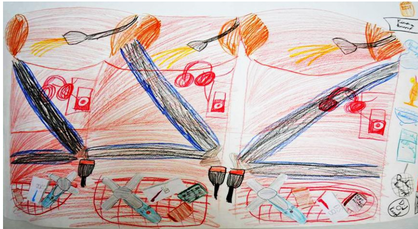
Fig.2. Proposed rear seat layout with three identical seats

together giving them the possibility to sing the songs as a family. “We dock our MP3 Player so that mum and dad can also listen to our music - Michael Jackson is awesome!” Technology therefore has to be flexible when being used as either single or multiple user technology.