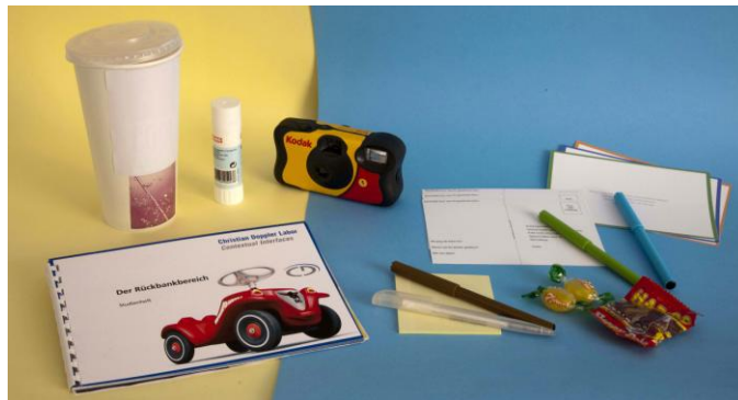
Fig. 1. Probing Package

The probing package included a roadbook, utilizing the metaphor of the diagrammatic book used in rally sports. The roadbook was a 21x14.8cm (DIN A5) booklet containing a double page for each probing activity (see details below). It additionally contained free pages for painting and other unstructured input and a page with the contact data of the study organizers. Apart from the roadbook, the probing package included materials needed to conduct the probing activities: pens, markers, glue, sticky notes, a disposable camera, postcards, stickers and a large sheet of paper for a collage (see figure 1).