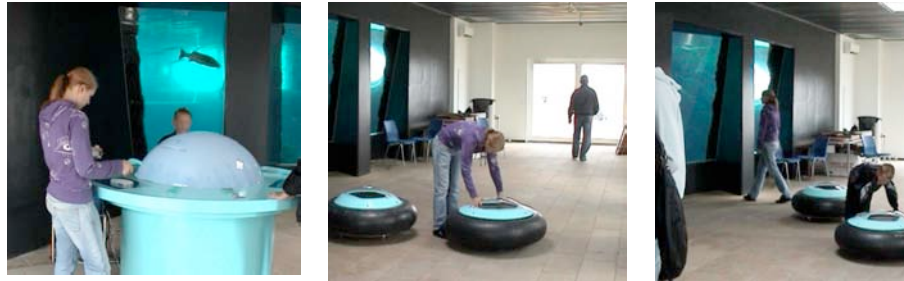
Fig. 3 (A) The girl moving between the construction table, (B) the Hydrosopes and (C) the large aquarium.

There are several things worth noting, with regard to the elements of engagement described in the previous section. During the first part of the user's interaction (Fig. 3, A), the girl is using the construction table by herself, and goes back and forth between the Hydrosopes and the construction table every time she has constructed a fish. Finding her own fish in the Hydrosopes inspires her to create new fish, which in turn prompts her to explore the digital ocean through the Hydrosopes. After approximately ten minutes, the girl loses interest in the Hydrosopes, walks to the large window of the aquarium, and spends a few moments looking at the fish (Fig. 3, C). After having watched the aquarium for a few moments, the rest of her family enters the room, and her father begins to construct a fish at the construction table. The girl immediately joins her father, and they collaborate on building a new fish. As her father is apparently using the installation for the first time, on several occasions the girl instructs her father on how the installation works (Fig. 4, A). After a few moments, her attention turns to her mother and her younger brother, who are exploring the digital ocean through one of the Hydrosopes. She walks to the Hydrosopes, and spends time moving one of these around with her brother (Fig. 4, B), before returning to the large aquarium windows.