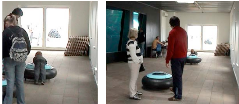
Fig. 5. (A) A boy exploring the content of the Hydrosopes and (B) using the Hydroscope as a stock car (right).

In the second example, involving the Hydrosopes, we focus on transformations between being primarily engaged with the content, to being engaged with the physical form of the hydroscope.