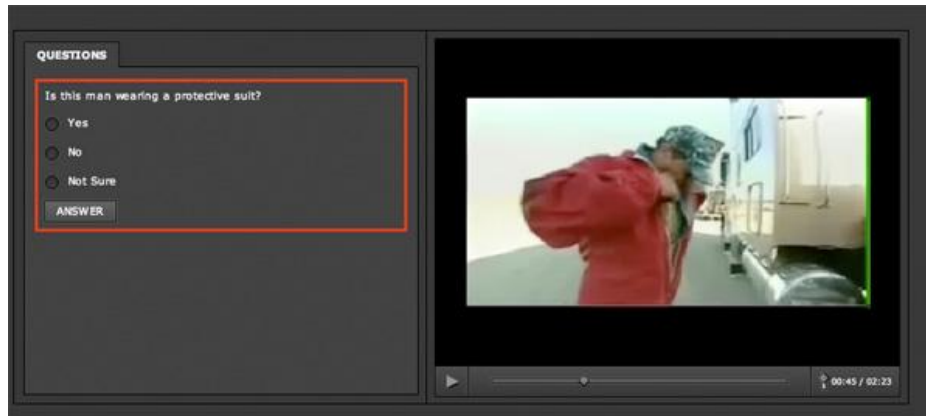
Fig. 1. Screenshot of the prototype interface

contextual conditions, with respect to the user's current activity: In context , Out of context , and Opportune .