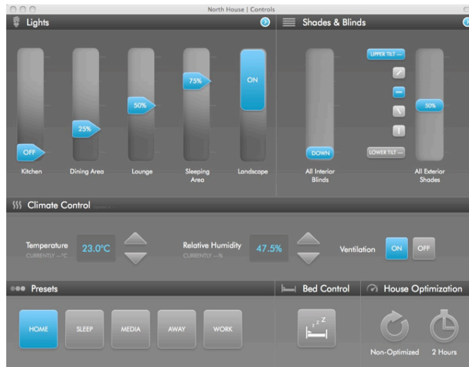
Figure 4: One view of the ALIS controls interface.

resident can configure energy-optimizing “modes” as presets in ALIS controls: for example, turning off most lights and lowering the thermostat in a “Sleep mode”, or tuning settings and shutting down standby power in “Away” mode. These presets can be activated via