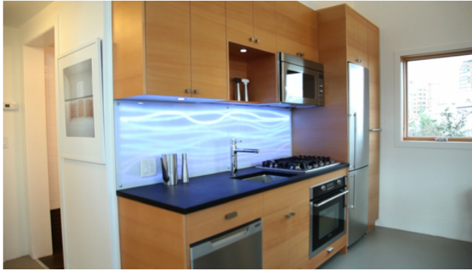
Figure 4. The Ambient Canvas

We are exploring the use of informative art visualizations in two contexts. The Ambient Canvas is an informative art piece embedded in the kitchen backsplash that provides