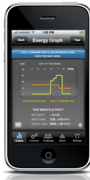
Figure 5: Mobile

The mobile device provides feedback and control to the residents of the home from their pocket – a simplified remote house control. Mobile applications were developed as an extension of the web application (Figure 5). They offer a subset of the features available in the PC user interface, with each feature redesigned for use on a mobile device. For example, the controls available from the mobile emphasize ease of use through logical groupings. These “master” controls allow the resident to adjust the lights for a whole room, or shades for a whole house façade, with a single control. More fine-grained control of individual fixtures is still available, but a hierarchy of control makes the most used items easily accessible. Graphing displays are simplified; a playful ‘Spinner’ interface allows residents to select pairs of performance