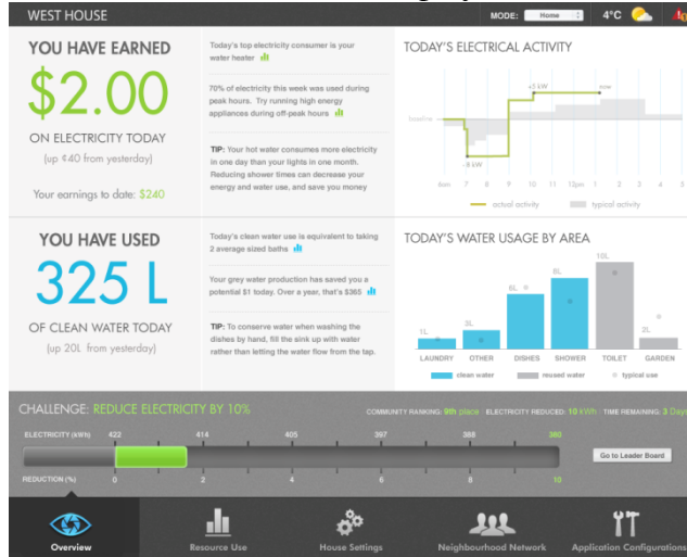
Figure 2. The Dashboard

comprises different forms: a set of variably configured client interfaces run on web browsers in several platforms; a mobile application; and ambient, “informative art” displays embedded in the home.