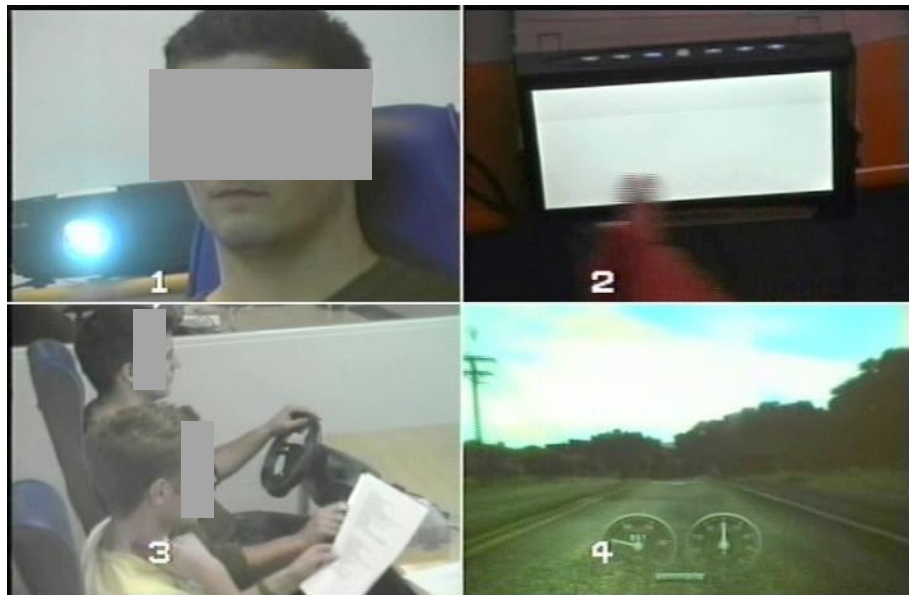
Figure 2. Excerpt from the video recordings illustrating the driving simulator and the four different cameras. (1) Capturing eye glance for driver attention analysis, (2) input and output screen (here for gesture and audio), (3) the driver and experiment facilitator, and (4) (left) the driving simulator.

unexpected potential hazards as the application integrates computer-controlled drivers on the road (similar to [19]). The setup also included two sets of speakers with one set of 4.1 surround sound speakers playing the sound of the game, and another set of 2.1 stereo speakers for music playback. The game was projected onto the wall in front of the subjects. The speedometer and tachometer of the car was visible to the subjects during the test as part of the projected image. The test subjects occupied the driver's seat while the test leader sat in the passenger seat during the test (figure 2.3).