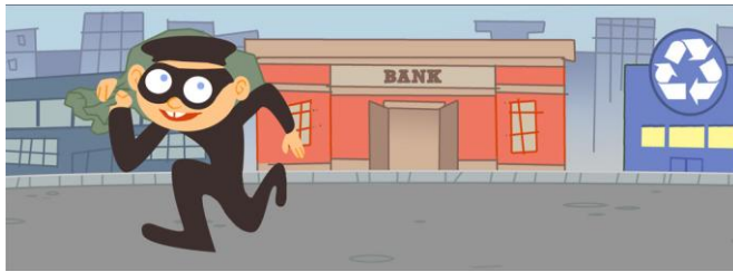
Fig. 5. World Event: Crime Spree (negative).

At the end of the game, a display informs the players of how they did. Summary information about group and individual outcomes is given through graphics and simple text. The game is designed to be played over and over in order to adjust strategies and learn from mistakes. It is possible, but non-trivial to end with a balanced game world. A video of the Futura project is available at http://www.antle.iat.sfu.ca/Futura/ .