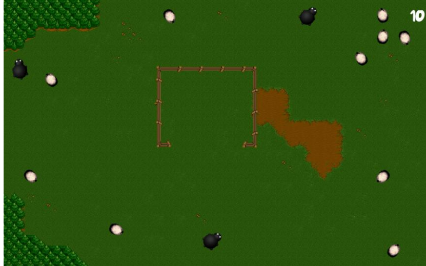
Fig. 2. Screenshot of Mind the Sheep! with three black dogs and ten white sheep. The pen is located in the center.

The dogs use a simple A* search based path finding algorithm to move to a specific location on the map. By default, sheep will walk around and graze randomly. However, when a dog approaches, they will tend to flock and move away from the dog allowing them to be herded in a desired direction. The flocking behavior is introduced by using the boids algorithm [22]. By positioning the dogs at strategic locations on the map a flock of sheep can be directed into the pen.