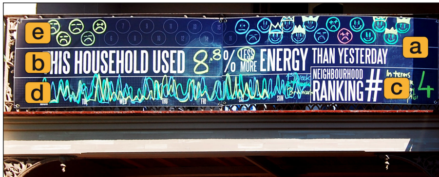
Figure 2. Overview of the graphical depictions on the public feedback display: Marginal Notes (a), Daily Performances (b), Neighborhood Ranking (c), Historical Graph (d), Pictorial Bar (e).

f. Private Display . Households were also provided with a common electricity monitor, embedded in a custom-made blackboard (Figure 5, Right). We decided on giving explicit access to the monitor device in order to entice the trust that the information shown on the public display was based on continuous and accurate measurements. The small, custom-made blackboard aimed to encourage participants to take notes about appliance usage or other energy-related observations, similar to keeping a journal, which can support self-reflection and in turn, the discovery of intrinsic factors of motivation [24]. The private display was pre-printed with weekday abbreviations to accentuate the daily update cycles embodied by the public display.