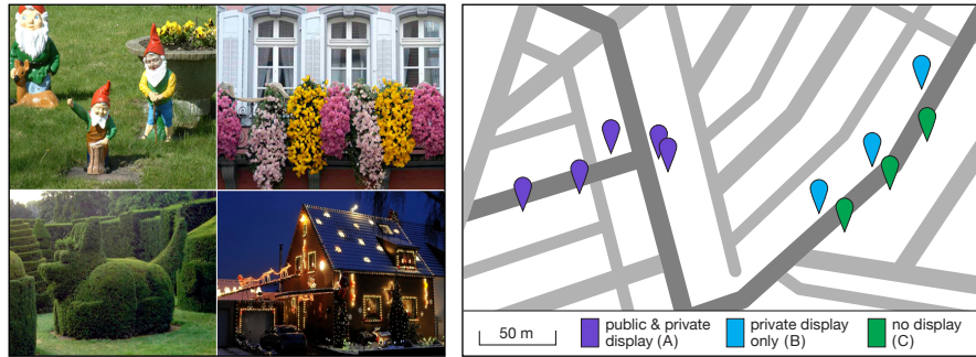
Figure 1. Left: Existing forms of social competition in the semi-public domain of the house façade and front garden. Right: A neighborhood map highlighting the participating households.

information, such as game scores, supermarket prices, or the water temperature in the public swimming pool. Even more, we expected that the manual act of updating a chalkboard could open up the opportunity for people to casually interact with the writer, so that a ‘data update’ has the potential to grow into a true ‘social event’, contrasting the unnoticeable millisecond blip of an electronic display.