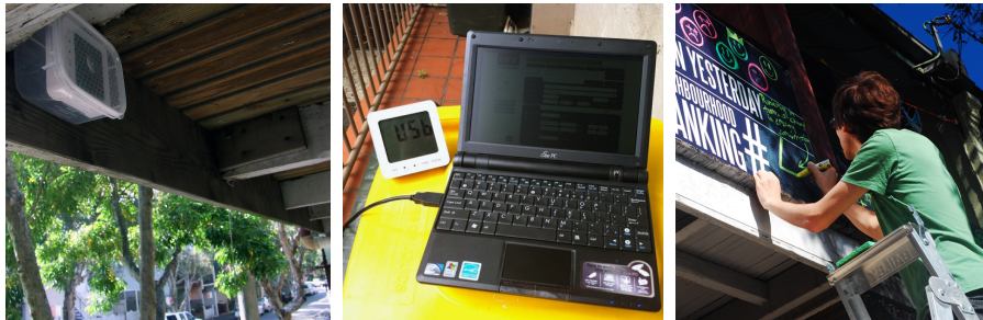
Figure 3. Left: Hidden storage of a separate electricity monitor allowing uninterrupted access to the data. Center: Netbook and electricity monitor used for downloading and updating displays. Right: The manual update of the daily neighborhood ranking using a ladder.

using Corflute®, a light material made of twin wall polypropylene sheets (with an average size of 3.3x0.8m). Simple eyelets were used to mount the sheets onto the terrace fences with standard cable ties. The content was written and drawn using standard liquid chalk pens, which have the advantage over common chalk to be fairly water resistant. A 14-tread ladder was necessary to reach the displays (Figure 3, Right). A second Efergy E2 wireless monitor was used for the private display. The blackboard that encompassed the private display unit was custom-made with a size of 26x23cm and a chalk tray attached to the front (Figure 5, Right). The blackboard came with a detachable stand and a small hook for placing or hanging the display anywhere inside the home. The display could be set to reveal instant kilowatts, carbon emissions or costs per hour (with an update rate of 8s), as well as show the historical trends for the previous seven days.