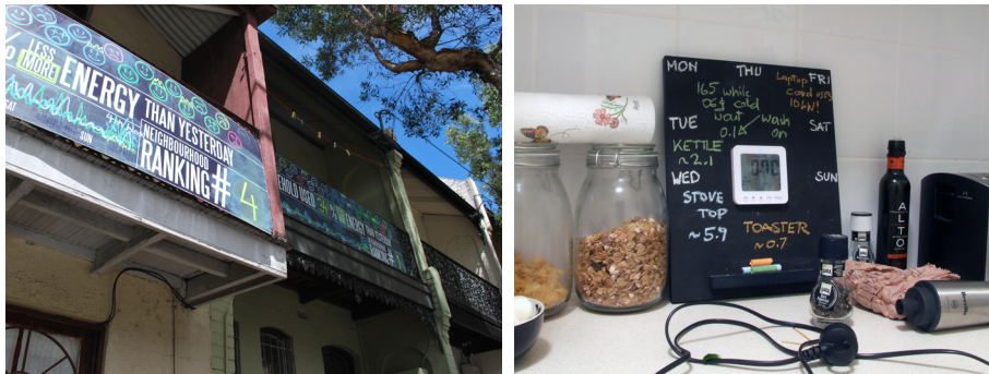
Figure 5. Left: Neighboring public feedback displays during the last week of the study. Right: A private feedback display embedded in blackboard showing notes on appliance usage.

participants stated that they were trying “to do their bit”, which included switching off lights (n=11), switching off appliances at the power plug (n=6), replacing bulbs with energy-efficient lighting (n=3), replacing electric water heating or stoves with gas ones (n=2), and partly switching to green energy (n=2). None of the households was regularly checking their electricity meter to monitor consumption. However, all households were monitoring their energy bills regularly, at least to check the total costs, while some also checked other data provided on the bill, such as greenhouse emissions. Nine households stated that they compared their consumption from bill to bill, mainly to see whether the costs had increased, and then would decide whether to look into the information provided on the bill in more detail. Only one household (H10) had actually compared their consumption with those of others.