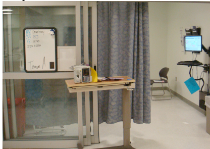
Figure 3. The whiteboard hung outside each patient room. It shows the room nurse belongs to "Team A"

Helping with the room nurses' temporarily heavy workload is theoretically one of the daily duties of the float nurse. However, situations wherein the room nurse is physically present but is unable to give the needed attention to a patient tend to be urgent, and though the float nurse could be called, there probably would not be enough time for the necessary patient information to pass from the room nurse to the float nurse. In a new strategy developed by nurses at our field site called "team nursing," nurses cover locally for each other in cases such as these.