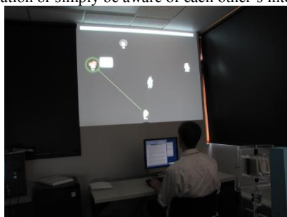
Figure 3. A user seated in front of an OMNI display, with four remote contacts. The user is focused on the leftmost contact, as indicated by the line.

appear next to Alex's avatar on Bill's display. If Bill continues to look at this information, (i.e., as Bill's focus level on Alex increases), Bill's avatar on Alex's display moves toward Alex. Alex knows that Bill has noticed him, and can watch his display to see if Bill continues to attend to him. With sustained attention, they could opt to start a conversation or simply be aware of each other's interest.