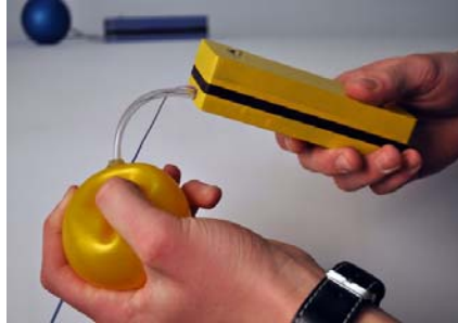
Fig. 3 The final prototype

Prototypes were created to validate certain design steps and later developed into a more experiential and advanced prototype, momentarily as a final design. Further investigations should be made to quantify the influence of the new product within a conversation. This would provide more insight for developments. In future, PU rubber material should be adopted, as it would enhance the interaction with the ball. Furthermore, investigations should be made to know if people are more likely to use a desktop application when the ball device is introduced. At this point, it is essential to evaluate the prototype with an aphasia therapist/expert to gain contextual insight; afterwards, a user test with actual users like aphasics may commence. An initial test between a person with aphasia and his/her therapist should be done before trying out in more dynamic situations. The design concept developed in this paper can eventually serve as an intervention tool, which can be integrated into application interfaces already built for people with aphasia.