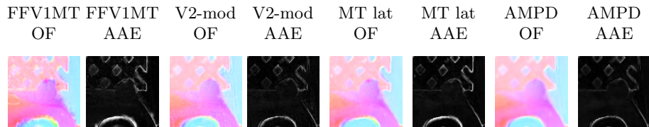
Fig. 3. Comparison of the effects on optic flow computation of the different neural mechanisms considered: in particular “V2-mod” refers to the V2-Modulated Pooling and “MT lat” to the MT Lateral Interactions.