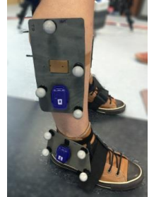
Fig 1. Experimental setup (two IMUs and motion capture markers)

Electrical stimulation (ES) assisted correction of foot drop in hemiparetic subjects would benefit from an efficient adaptation of the stimulation pattern regarding foot and/or shank orientations. In order to satisfy practical rehabilitation constraints and to design a feasible solution we propose a body area network (BAN) of embedded inertial measurement units (IMU). This preliminary study presents gait assessment results from experiments realized on seven hemiparetic patients (5 male, 2 female, age: 26 to 65 years, height: 1.63m to 1.85m). The subjects were instructed to walk along a 5 meters GAITRite ® electronic walkway (CIR Systems, Inc., Havertown, PA, USA) with two FOX HikoB ® (HikoB Villeurbanne, France) inertial measurement units respectively strapped to the foot and the shank of each leg, as illustrated in Figure 1. A motion capture system (VICON ® Bonita, USA) combined with an industrial object tracking software (VICON ® Tracker) has been used to provide the reference measurements for each IMU and to compare reconstruction results.