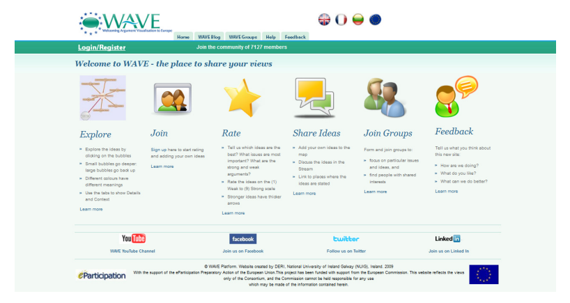
Fig. 1. WAVE Platform Home Page (EU pilot)