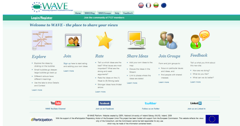
Fig. 1. WAVE Platform Home Page (EU pilot)