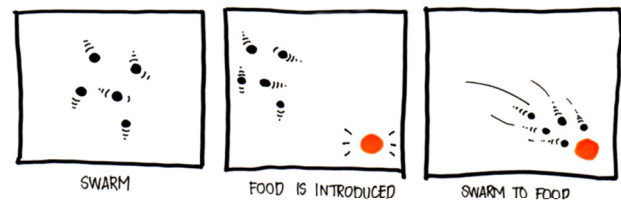
Figure 2: A sketch of a naïve swarming behavior. Fireflies will move towards a food source when food is introduced.

Groupings of fireflies can be made with predefined sorting categories based on the participants' demographics. The right-hand side of the visualization shows a list of available sorting categories ( location, age-range, knowledge, and attitude ). Clicking on each will group the fireflies into clusters based on the category. Another way of grouping fireflies is to perform textual queries, for example, by typing “province=alberta” in the query box. Lastly, clicking on fireflies will pull other fireflies that are similar to it. Similarity is currently determined by participant age-range and knowledge level,