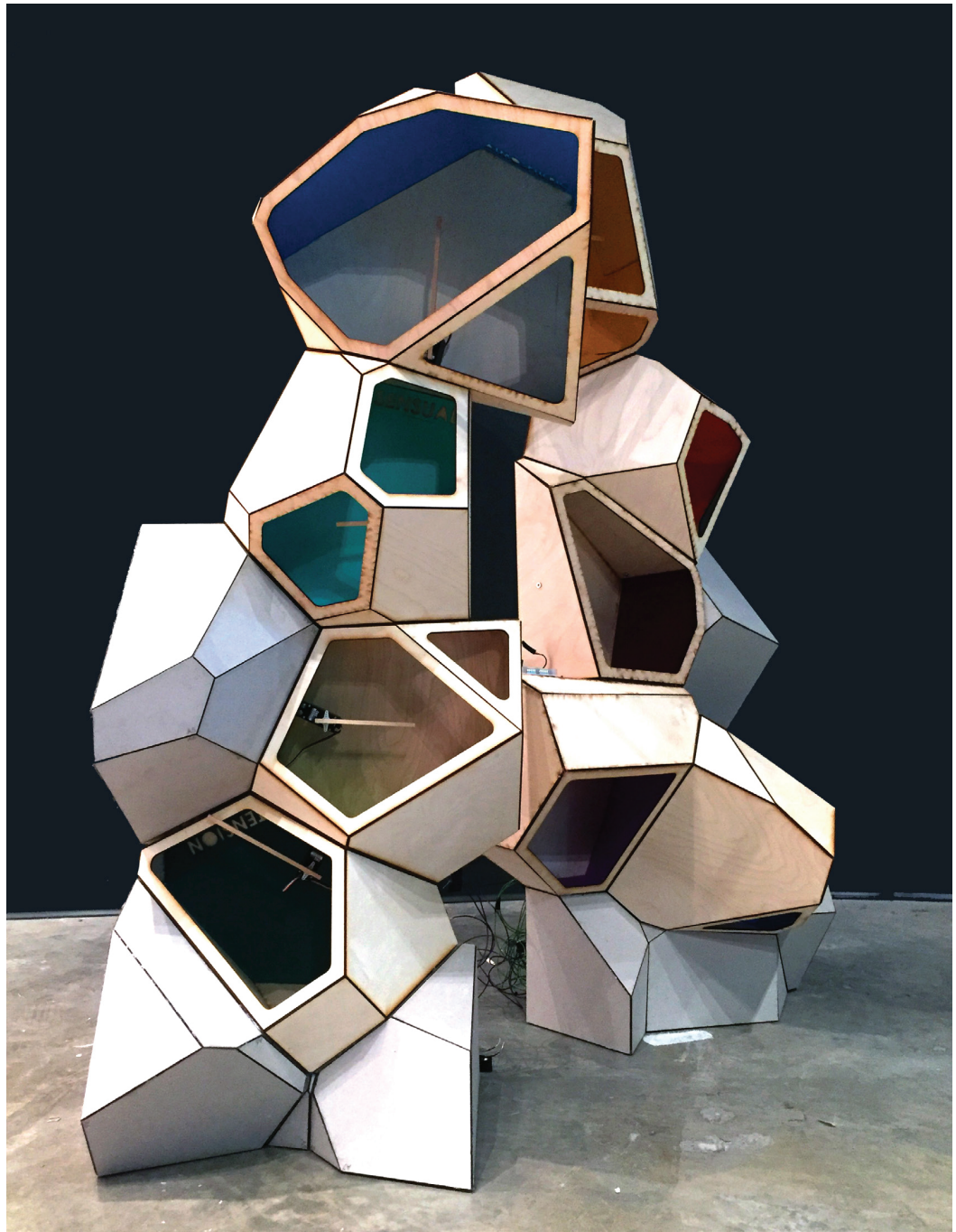
Figure 2: Chameleon skin, music and mood by Roxane Fallah. The images on the left show bio-inspirations, with the skin of a chameleon changing colour according to its mood. The image on the right is the physical, ambient, dynamic installation that represents the mood conveyed by a song when played.

used to depict comfort levels concerning HIV/AIDS, with particles representing participants less comfortable with HIV/AIDS appearing agitated and nervous. The visual properties of fireflies led to an expressive representation of a sensitive dataset (see Figure 1).