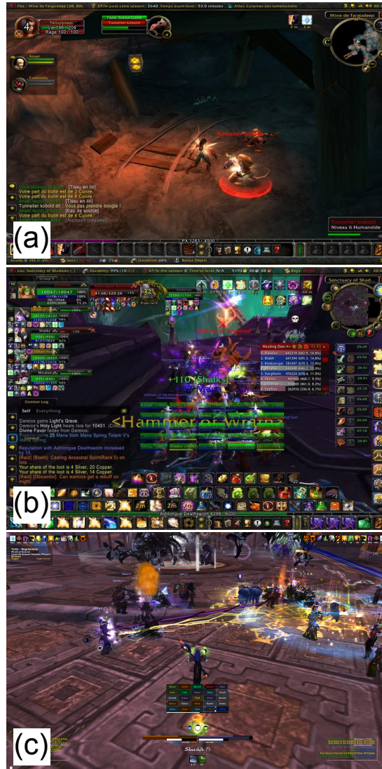
Figure 8: Novice (a), advanced (b), and expert (c) UI.