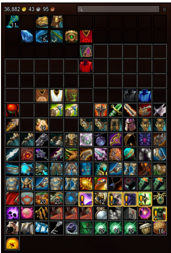
Figure 2: Advanced bag interface.

popular MMORPG. This highly-addictive multi-player game is the true evidence that the degree of usage over time—especially of a product which is voluntarily used—is related to the quality of user experience [5].