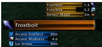
Figure 5: Quartz addon.

and conversely, featuring unused commands on the screen may break the player's state of flow .