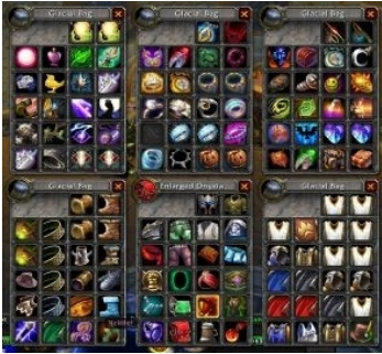
Figure 1: Default bag interface.