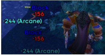
Figure 3: Scrolling Combat Text addon.