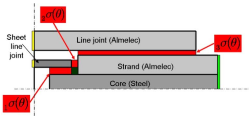
Fig. 3. Axisymmetrical cross section of half a line joint.

to build list B^j and E^j for A2, TCG is the time needed for CG convergence, the rate is the ratio between Tb and TCG, and the total time represents the complete solving time.