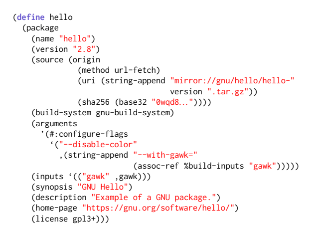
Figure 1. A package definition using the high-level interface.

Guix implements this functional deployment paradigm pioneered by Nix but, as explained in previous work, its implementation departs from Nix in interesting ways [3]. First, while Nix relies on a custom domain-specific language (DSL), the Nix language, Guix instead implements a set of DSLs and data structures embedded in the general-purpose language Scheme. This simplifies the development of user interfaces and tools, and allows users to benefit from everything a general-purpose language brings: compiler, debugger, REPL, editor support, libraries, and so on.