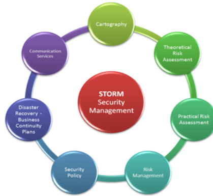
Fig. 2. STORM Security Management Services

perspective (e.g. deficiencies, security incidents, backup procedures, countermeasures of their department). This allows the accumulation of objective information that can be used as input for the execution of the risk analysis and risk management procedures in an effective and efficient manner.