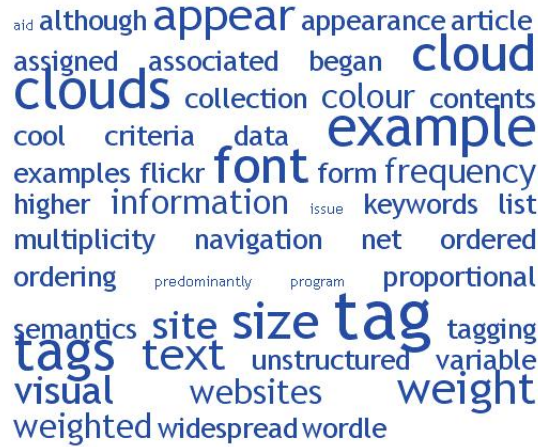
Fig. 1. Example from a TagCrowd 1 tag cloud

to accurately organize relevant data. These user-generated tags can then be embedded into a graphical frame, i.e. a tag cloud within the users personal profile. A tag cloud can also serve as a categorization method for special content items where the font size of each tag reflects the quantity of subsequent content items in a given category. Keeping in mind these different tasks where tag clouds can be involved, user-related factors such as individual skills and familiarity with this kind of tool will always have an impact on the resulting performance during an interaction. It is therefore important to consider that different search scenarios exist, originating from personal search intentions in various search contexts. Different browsing contexts depend on the goals and intentions of the users, which lead to different browsing behaviors. We will discuss the significance of these scenarios later in this work.