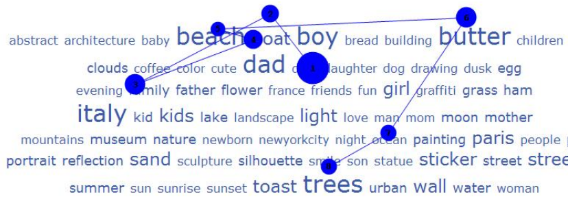
Fig. 3. Gaze plots showing fixations on tags with large font size

than the smaller ones, tags with small font size positioned in the bottom right quadrant risk being neglected by the users attention. This observation should be a principal motivator for conceptual adaptations in future design considerations.