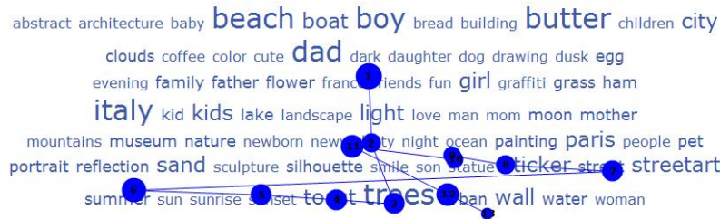
Fig. 4. Targeted search behavior for the target tag "water" (alphabetic layout)

Tag clouds with semantically clustered tag arrangements have been implemented by a series of research groups. Semantic relatedness is most often defined by the means of relative co-occurrence between tags (see section 4.1). Whereas some could determine a better search performance of their participants for the interaction with a semantically clustered tag cloud [Hassan-Montero2006], the results in our experiments did not show such an improving effect [Schrammel2009b]. Nevertheless the study showed that semantically clustered tag clouds can provide improvements over random layouts in specific search tasks. Also, semantically structured tag clouds were preferred by about half of the users for general search tasks, whereas tag cloud layout did not seem to influence the ability to remember tags.