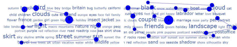
Fig. 5. Example of a "S - scan" (left) and a "right loop" (right) pattern