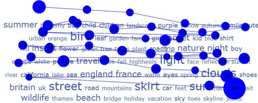
Fig. 6. Gaze plot for serial search using zigzag pattern (semantic layout); note the upward dislocation of the gaze plot due to unsystematic head motor activity of the participant

Focusing on performance in different layouts, research on the perception of alphabetically ordered tag clouds showed that search processing becomes much more targeted once the user recognizes this principle of organization (see Fig. 4) [Kaser2007], [Schrammel2009b]. An example is shown in Figure 5 where the gaze heads first to a very large tag at the bottom of the cloud. Scanning inverse to reading direction is then initiated until the alphabetic order is recognized. Eye movements turn to the region where the target tag is estimated, following the perceived principle of organisation.