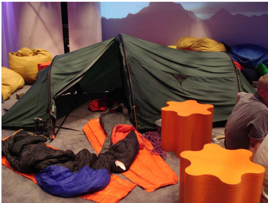
Fig. 4. Tent camp in the Alps; a travel metaphor implemented in the "land of opportunity"

The prototype developed at the workshop need not be a working functional prototype. It may be a simple drawing of a process, a sketch of a product or something similar. For the workshop we use "the land of opportunity". Figure 4 shows an example of the workshop setup from "a hike in the Alps"; the idea is to imagine being in a tent camp in the mountains.