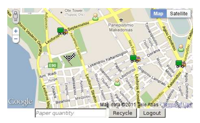
Fig. 2. Web Interface of EcoTruck Application

In [10] authors employ multi-agent simulation coupled with a GIS to assist decision making in solid waste collection in urban areas. Although the approach concerned truck routing, it was in a completely different context than the one described in the present paper: the former aimed at validating alternative scenarios by multi-agent modelling in the waste collection process, while EcoTruck aims at dynamically creating truck paths based on real time user requests.