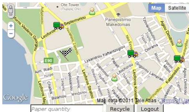
Fig. 2. Web Interface of EcoTruck Application

In [10] authors employ multi-agent simulation coupled with a GIS to assist decision making in solid waste collection in urban areas. Although the approach concerned truck routing, it was in a completely different context than the one described in the present paper: the former aimed at validating alternative scenarios by multi-agent modelling in the waste collection process, while EcoTruck aims at dynamically creating truck paths based on real time user requests.