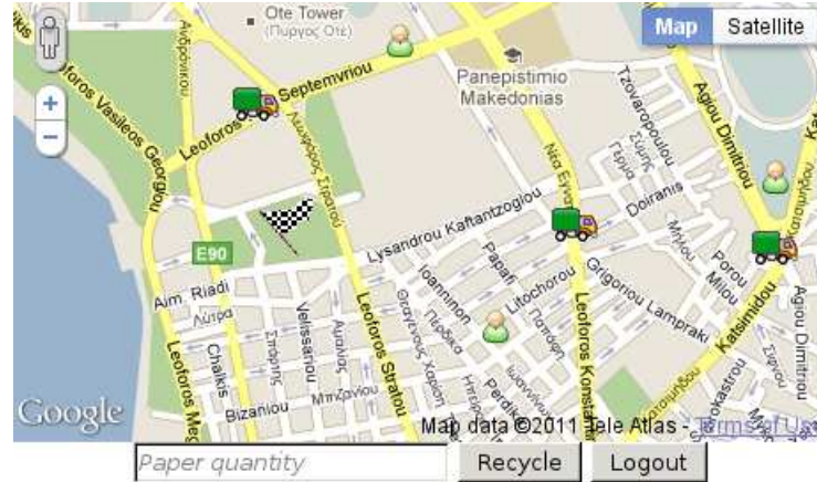
Fig. 2. Web Interface of EcoTruck Application

In [10] authors employ multi-agent simulation coupled with a GIS to assist decision making in solid waste collection in urban areas. Although the approach concerned truck routing, it was in a completely different context than the one described in the present paper: the former aimed at validating alternative scenarios by multi-agent modelling in the waste collection process, while EcoTruck aims at dynamically creating truck paths based on real time user requests.