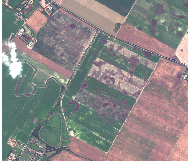
Fig. 1. Part of the satellite image used to derive the training data set and test the classifiers. Only red, green and blue bands are shown.

Knowledge Discovery (WEKA) [22]. This is the suite that has been used to conduct experiments detailed in Section 4.