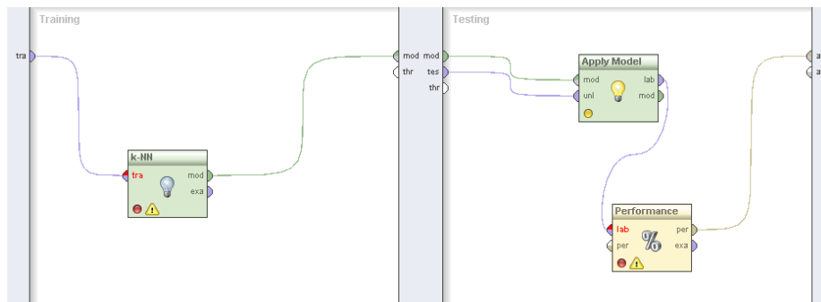
Fig. 2. The embedded training and testing process for a k -nn classification model in Rapidminer workflow.

one-out resampling technique. It is important to note that applying and evaluating a classifier within Rapidminer is a rather simple procedure, given that the user has set the implementation details of the classifier (e.g. number of neighbor for a k -nn classifier), the validation procedure to apply, and the attribute of the examples set fed to the classifier that will be used as a target class.