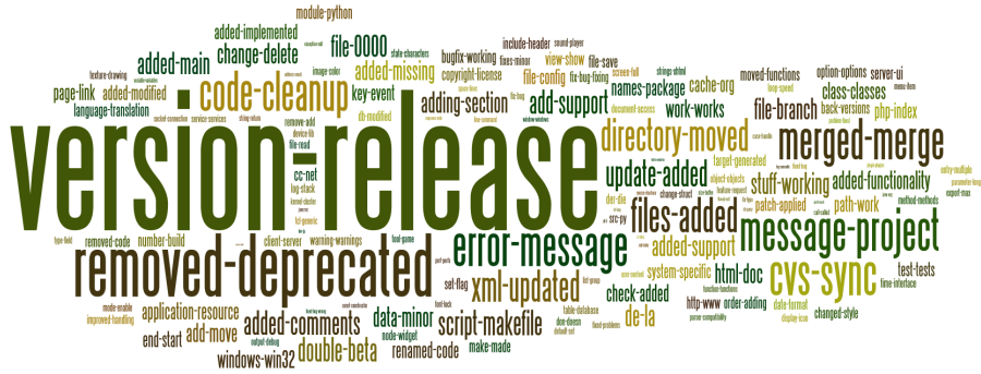
Fig. 5. Topic Tag Cloud: Cliff Walls (“initial-import” excluded)

Overall Topic Proportion and Topic Relative Rank. We discuss these in the next two subsections.