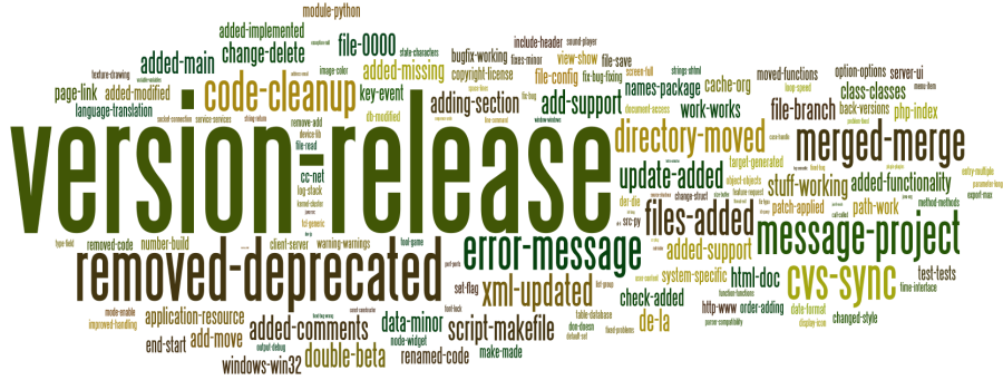
Fig. 5. Topic Tag Cloud: Cliff Walls (“initial-import” excluded)

Overall Topic Proportion and Topic Relative Rank. We discuss these in the next two subsections.