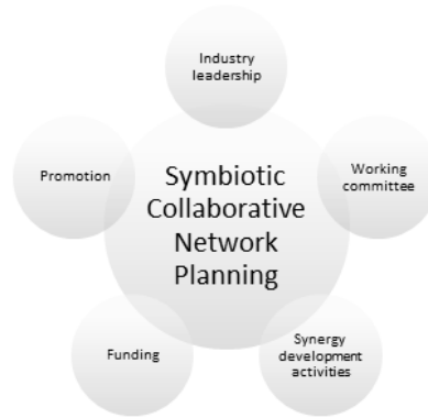
Fig. 3. Facilitating structures to achieve industrial symbiosis.

industry facilitation and provision of technical assistance for symbiosis development (Figure 3).