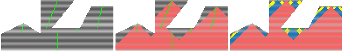
Figure 1: In this 2D world, the objects are represented as a stack of slices and each slice is a set of collinear horizontal line segments. Left: The main object is O (gray). The seed shape for the cavity is the medial axis of each slice of O , which, in 2D is simply the center of each segment (green). Middle: The cavity C^1 = \text{CAV}(O) is drawn red. Right: Iterated cavities. C^1 is drawn red, C^2 blue, C^3 yellow and C^4 green.

the complement of X : \bar{X} = \mathbb{R}^2 \setminus X . The opening of S of radius r is \text{OPEN}(S, r) = S^{\downarrow r \uparrow r} . The closing of S of radius r is \text{CLOSE}(S, r) = S^{\uparrow r \downarrow r} .