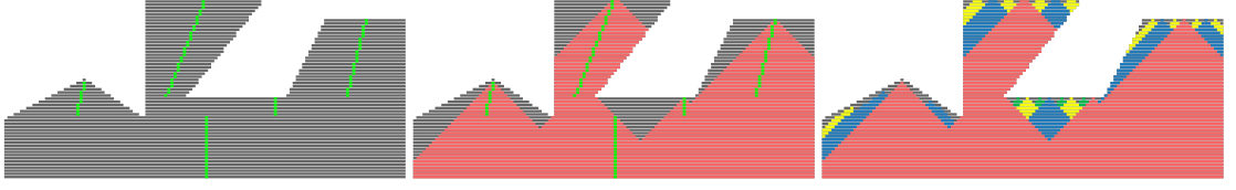
Figure 1: In this 2D world, the objects are represented as a stack of slices and each slice is a set of collinear horizontal line segments. Left: The main object is O (gray). The seed shape for the cavity is the medial axis of each slice of O , which, in 2D is simply the center of each segment (green). Middle: The cavity C^1 = \text{CAV}(O) is drawn red. Right: Iterated cavities. C^1 is drawn red, C^2 blue, C^3 yellow and C^4 green.

the complement of X : \bar{X} = \mathbb{R}^2 \setminus X . The opening of S of radius r is \text{OPEN}(S, r) = S^{\downarrow r \uparrow r} . The closing of S of radius r is \text{CLOSE}(S, r) = S^{\uparrow r \downarrow r} .