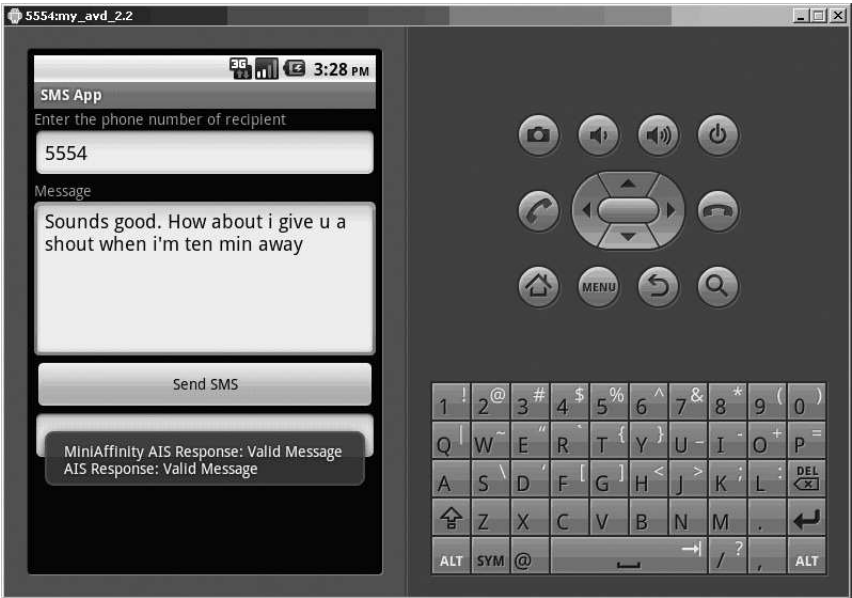
Figure 2. Response to a valid message.