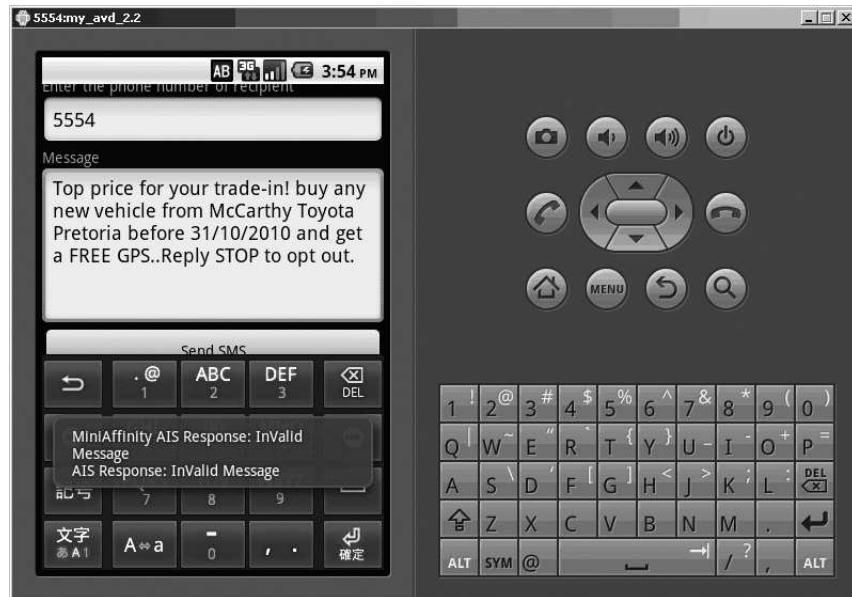
Figure 3. Response to an invalid message.