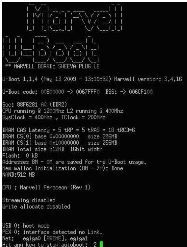
Figure 2. Stopping the operating system from booting.

This must be done quickly because the user only has a few seconds to stop the operating system from booting.