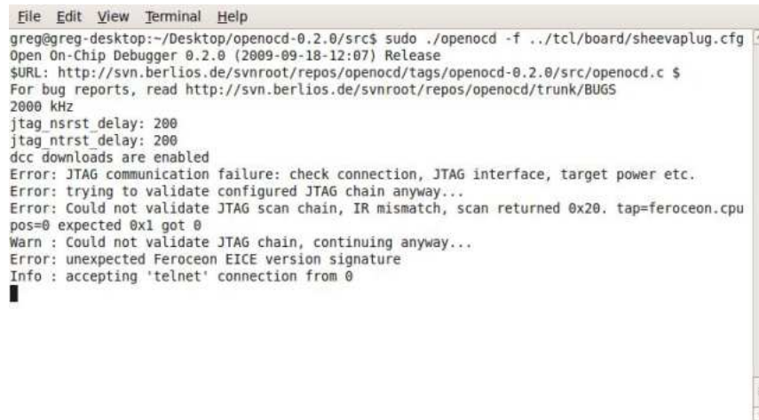
Figure 3. Running OpenOCD.