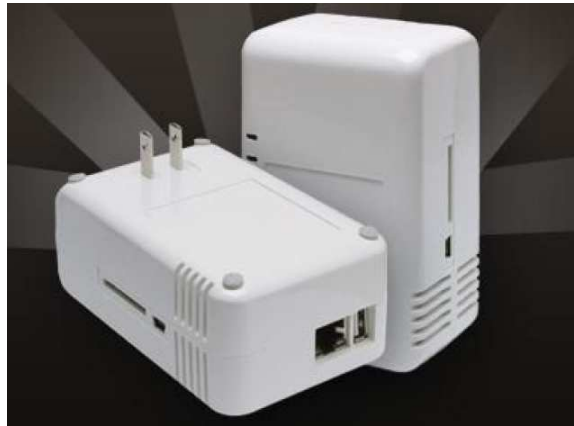
Figure 1. SheevaPlug plug computer.

and laptops, plug computers have the potential to be used in nefarious ways, all the while maintaining a low profile because of their small size.