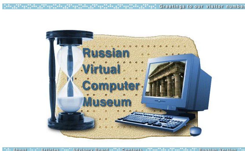
Fig 1. Virtual Computer Museum Home Page (2006) http://www.computer-museum.ru/english/