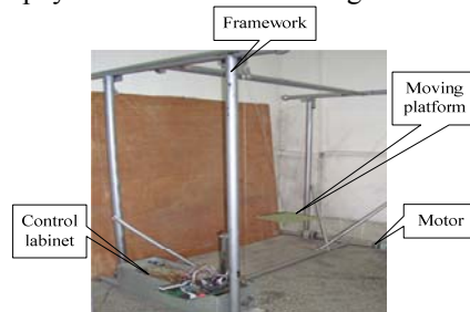
Fig. 3. The material object photography of the designed CMMS

This part attempts to verify the rationality and feasibility of adopting wire-driven PKM as coordinate measuring system through experiments. As some limitations, the designed probe is replaced by some parts in the following experiment. Therefore, checking the probe contacts with the work piece is determined by visual inspection. Besides, the kinematics error of the measuring platform is discussed, it includes the errors of the probe, the distortion of each rope, external conditions and so on. The material object photography of CMM is shown in figure 3.