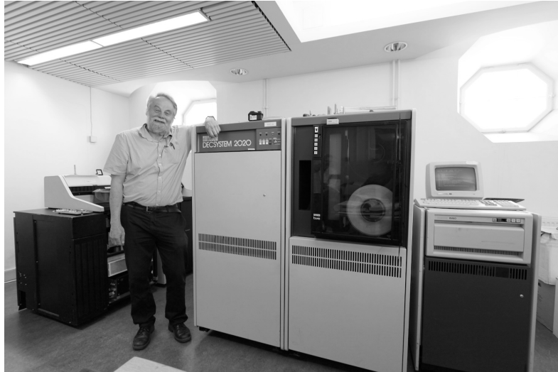
Fig. 2. DEC-2020 computer “Nadja,” used extensively for up to thirty parallel students’ interactive development and running of Simula programs 1979–88. It was revived 2010, started at first effort, here with the proud author. Historically important as the first mainframe academic computer owned (and run) by a department (NADA, KTH) and not by the six centralized computer centers, one in each university region in Sweden.