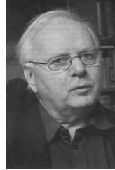
Fig. 1. O.-J. Dahl & K. Nygaard.

The development of computing education in the Nordic countries has been thoroughly described in several sessions at the History of Nordic Computing conferences in 2003 and 2007, as in [8].