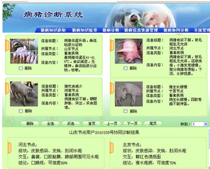
Fig. 3. Collaborative decision-making of swine diseases