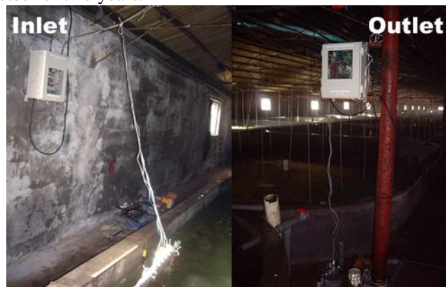
Fig. 2 The water-quality dynamic monitoring systems installed in a practical aquaculture.

Two water-quality dynamic monitoring systems were installed respectively in inlet and outlet of a workshop in Fengzeyuan aquafarm, Dongying Shandong Province, which adopts seawater and semi-circle mode for intensive aquiculture. Wi-Fi module was used in one of the devices, while Wi-Fi module and CDMA module with IPsec-based VPN function were used in another. In this testing, one remote information server with an IPsec-based VPN router is deployed in the China Agricultural University located in Beijing city. The testing experiments were conducted for two years.