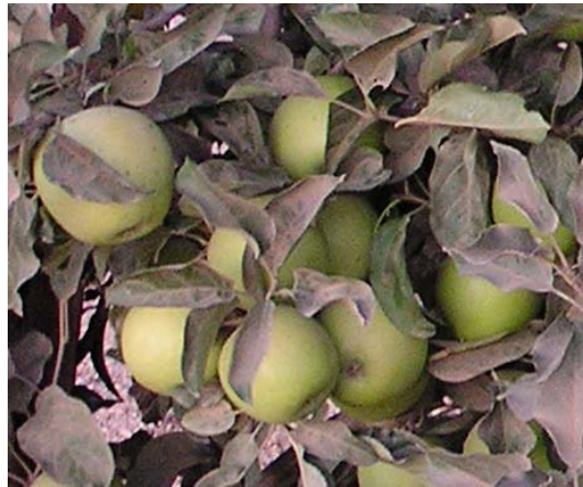
Fig. 4. Detail of a typical image with partial occultation of some of the apples

Most apples are partially hidden by other apples and/or by leaves (Figure 4)