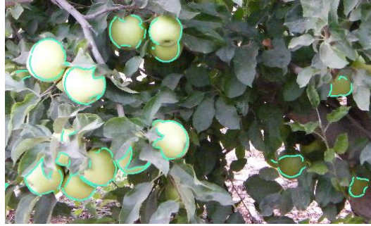
Fig. 14. Contours obtained after segmenting the contour of each seed region into arcs, linear segments and anamorphic segments

In the next step, the arcs are grouped into circles and at the end of this stage each circle indicates one apple.