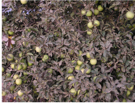
Fig. 3. Optimal image recorded under diffuse light (close to sunset) and with manually reduced exposure

Visual inspection of the numerous images collected during this study led to identifying the following common situations and developing an algorithm that could handle them accordingly: