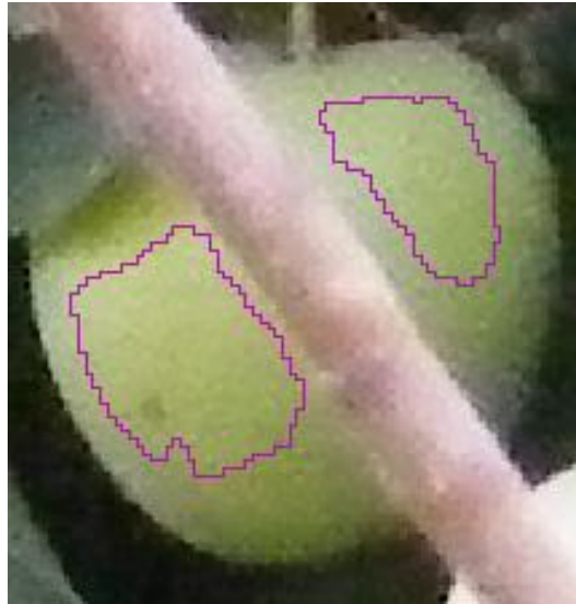
Fig. 10. Detail of an image that shows that a single apple may contain more than one seed region (purple contour) as a result of partial occultation

they belong. Each “seed area” consists of a connected set of pixels that have a high probability of belonging to an apple object. Ideally, each apple should result in one seed area that should cover most, if not all, of the apple. In practice, parts of the apple surface might be considerably darker or lighter, because of the amount of light that reaches it and of the way this light is reflected. Such areas are misclassified as "non-apple", resulting in a smaller seed area. Also, some apples appear as split objects due to partial occultation by branches or leaves, which results in several seed areas for the same apple (Figure 10).