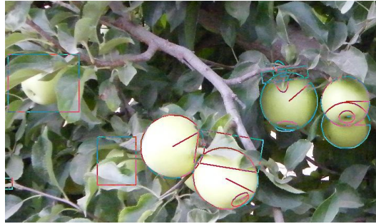
Fig. 8. Detail of an image with objects marked using the ImagingChef software. In addition to the apples (indicated by circles), regions that should be ignored at the calibration stage (such as apples that are barely visible or parts of apples that are occulted by leaves and branches) are marked by rectangles or ellipses.

the image, the properties defined for each object include (in addition to the object type) the relative depth of the object, so that the analysis takes into account partial occultations.