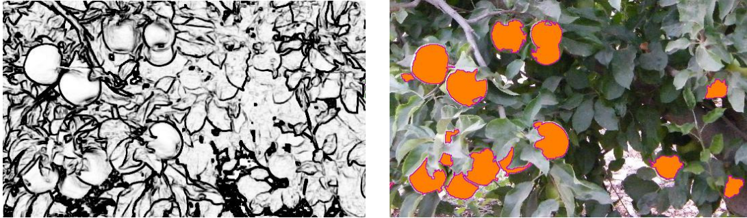
Fig. 12. (Left) Variance map of Picture 11a. (Right) Seed areas obtained by expanding the areas shown in Picture 11b using the variance map shown in Picture 12a