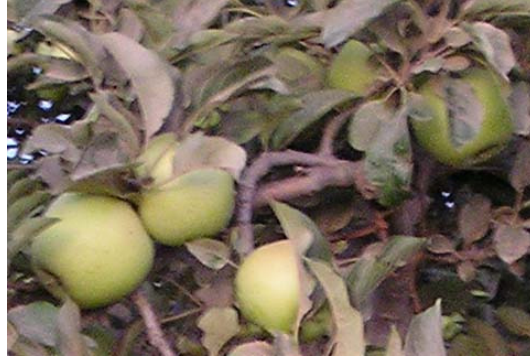
Fig. 7. Detail of an image showing the large color differences that exist between the apples on the outside of the tree and those deeper within the tree