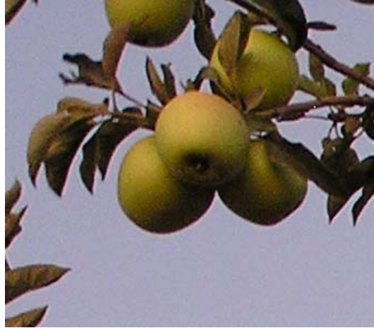
Fig. 5. Detail of an image showing non-uniform light distribution on the apples