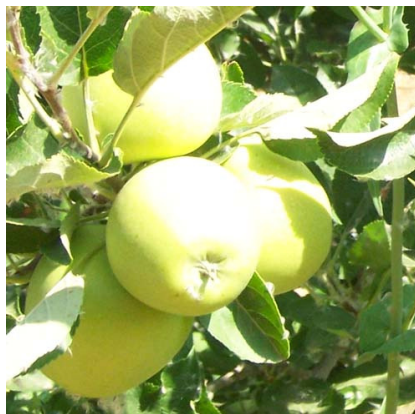
Fig. 2. Apples exposed to direct sunlight that causes saturation of the CCD and strong shadows

Figure 3 shows a typical image obtained with such optimal photography parameters. Although to the human eye such an image may seem too dark and "flat", it is much more suitable for computer analysis than a bright and shiny image.