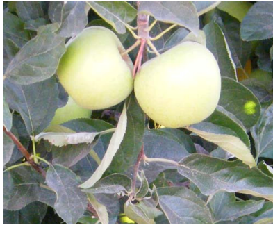
Fig. 1. Apples in ideal image

In ideal conditions, apples would appear as non-touching circular objects with smooth surface and distinctive color such as shown in Figure 1. In such a situation, finding and counting the apples within the image would be quite simple and would basically consist of finding blobs (clusters) of pixels within some predefined color range. However, such ideal situations are rarely found in images recorded in natural outdoor conditions. In such images, most apples are partially hidden by other apples and leaves, and their color is influenced by the environment, the light conditions and the photography parameters.