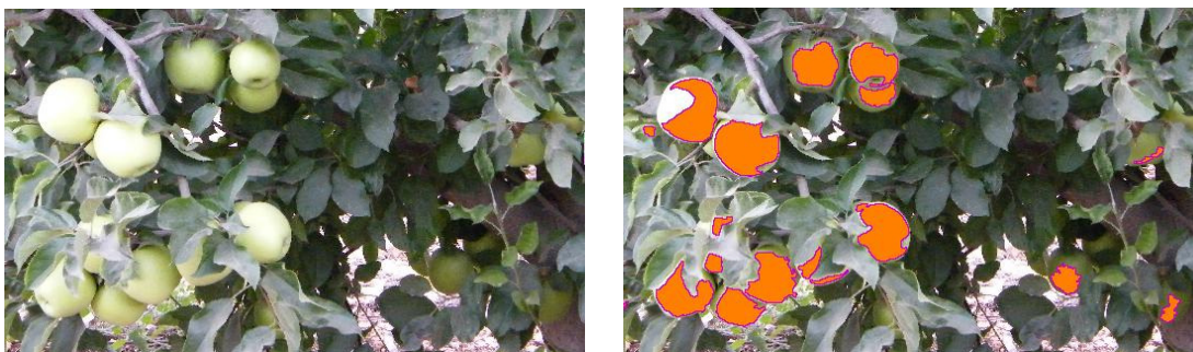
Fig. 11. (Left) Typical image. (Right) Detected "seed areas" (in orange)

Figure 11 shows typical results of the seed areas detection procedure. It can be seen that both saturated and darker pixels of the apple surfaces are not included in the seed areas.