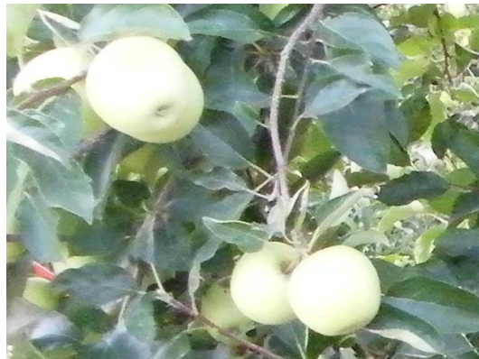
Fig. 6. Detail of an image with saturated regions in which all color information is lost

Sunlight can be reflected more intensely from some apples or from the apple surface regions that are perpendicular to the light source and this might cause local saturation. In such regions the red, green and blue components reach their maximum value (or close to it), and all color information is lost (Figure 6). Manual under-exposure of the images eliminates most, but not all, of these cases.