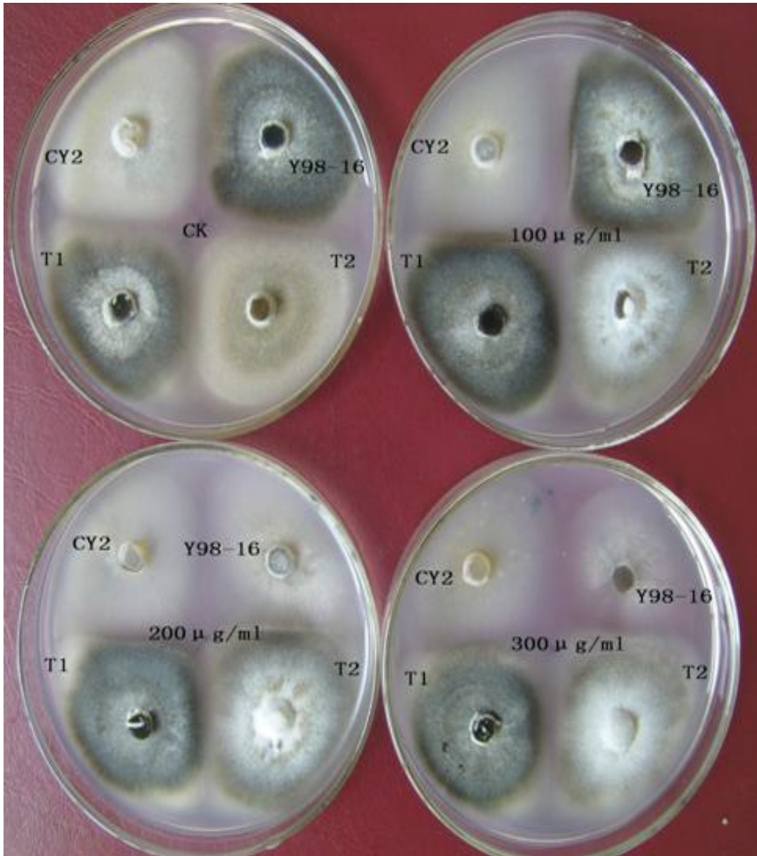
Fig.3 Chlorimuronethyl resistance test of wild type strains of CY2 and Y98-16 and two transformants of T1 and T2. CK (control): no chlorimuronethyl; 100 µg/ml mean concentration of chlorimuronethyl was 100 µg/ml; 200 µg/ml mean concentration of chlorimuronethyl was 200 µg/ml; 300 µg/ml mean concentration of chlorimuronethyl was 300 µg/ml.

chlorimuronethyl resistance gene and wild type strain of Y98-16. The aligned sequences of transformant and Y98-16 were cloned and sequenced from PCR products that using primer pairs of chlorimuronethyl resistant gene to amplify transformant DNA and Y98-16 DNA, respectively.