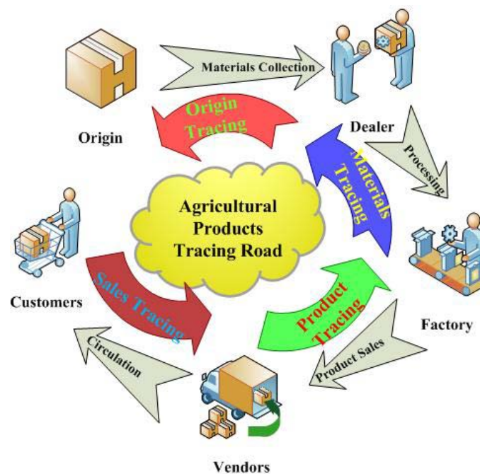
Fig. 1. Traditional flow from production to sales of agricultural product and quality traceability.

The information delivery, task assignment and cooperation in whole system are on the control of information management agent and task management agent.