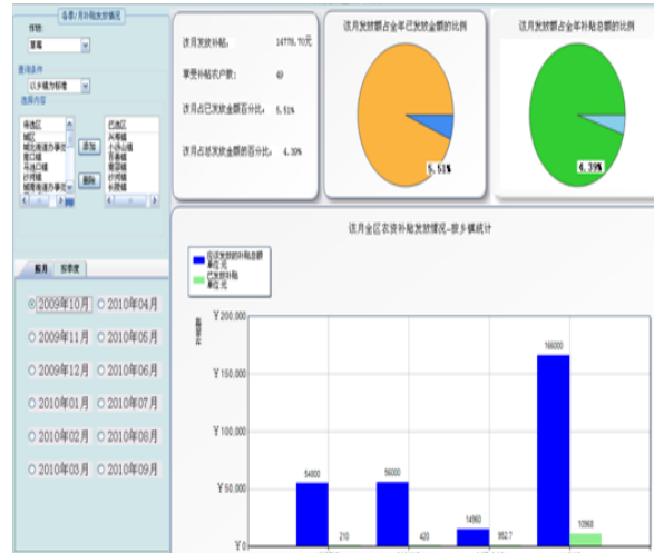
Fig.5 subsidy statistics by month page of the leader subsystem.