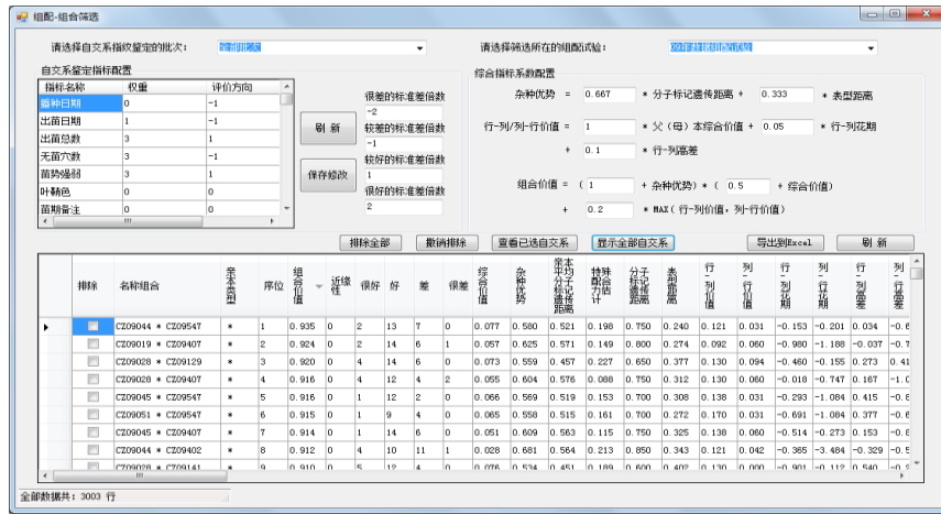
Fig. 3. The interface of hybrid combination order

78 inbred lines were got according to the inbred lines SSR data and phenotypic data screening. For each hybrid combination in this paper, it calculated the heterosis rates using formula 2, and calculated the orthogonal value or reciprocal value using formula 6, and calculated the comprehensive value using formula 8, then sorted the hybrid combinations by the comprehensive value (the sorting interface was shown in Figure 3 below).