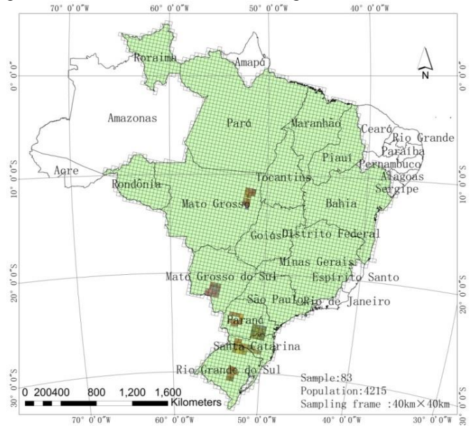
Fig. 3. The sketch map of image samples

The sampling frame covers 17 soybean planting states (from 2013 Brazil official statistics), which can be seen from fig3, the sampling unit was designed as 40 \text{km} \times 40 \text{km} . The population is 4215, which is shown on fig3.