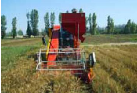
Fig. 4. Hanging harvester in China

University and two-row ridge harvester in Mexico. These two harvesters can not only ensure the harvest quality, but also keep ridge bed [2].