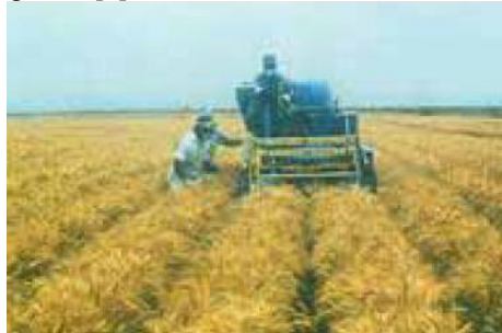
Fig. 5. Two-row ridge harvester in Mexico