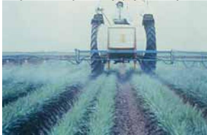
Fig. 3. Mexico sprayer for sunken controlled traffic farming system

Figure 3 shows the sprayer for sunken controlled traffic farming system in Mexico. The spraying is finished during crop growth season to control weed and insects; furrow is used for guide, which improves the spraying with overlap and misses [2].