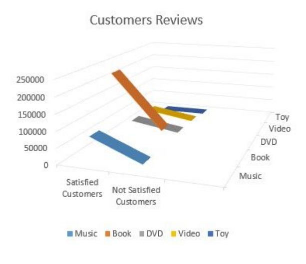
Fig. 2. Customers Reviews

Next Figure 2 illustrates the amount of customers who are satisfied with products of every category. We can observe that the number of satisfied customers is much bigger than the one of not satisfied ones in four out of five categories (regarding category entitled toy, the number is equal to 1 for both category of customers). With these results, one can easily figure out that Amazon customers are loyal to the corresponding company and prefer purchasing products from the abovementioned categories.