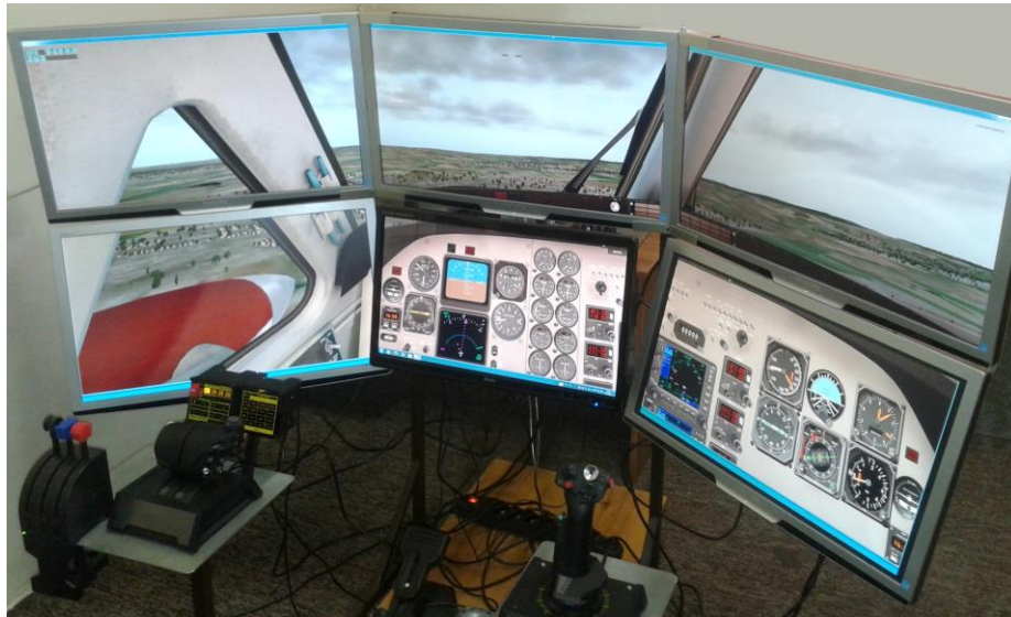
Fig.1. The simulator at the Department of Air Electrical Systems, University of Defence, built on the basis of X-Plane 10 simulation program.

The Department of Air Electrical Systems strives to keep up with these above mentioned trends, therefore the flight simulator based on X-Plane-10 software was built up to raise the quality of training and create a capacity for scientific research. The mission of the flight simulator at the University of Defence does not lie in competing with or replicating modern sophisticated simulators designed for pilot basic or improvement training. Using this simulator the authors prepare their procedures and methods for data gathering and evaluation. Currently, as described in the chapter Introduction, the authors are in the phase of repeated measurements running under the equal conditions and with the same pilots. The aim of which is to verify the accuracy of all analyses depending on repeatability with an emphasis laid on changes resulting from continuous training. Based on the knowledge obtained in such a manner, they will be able to implement the methodology of measurement and data evaluation on commercial full flight simulators.